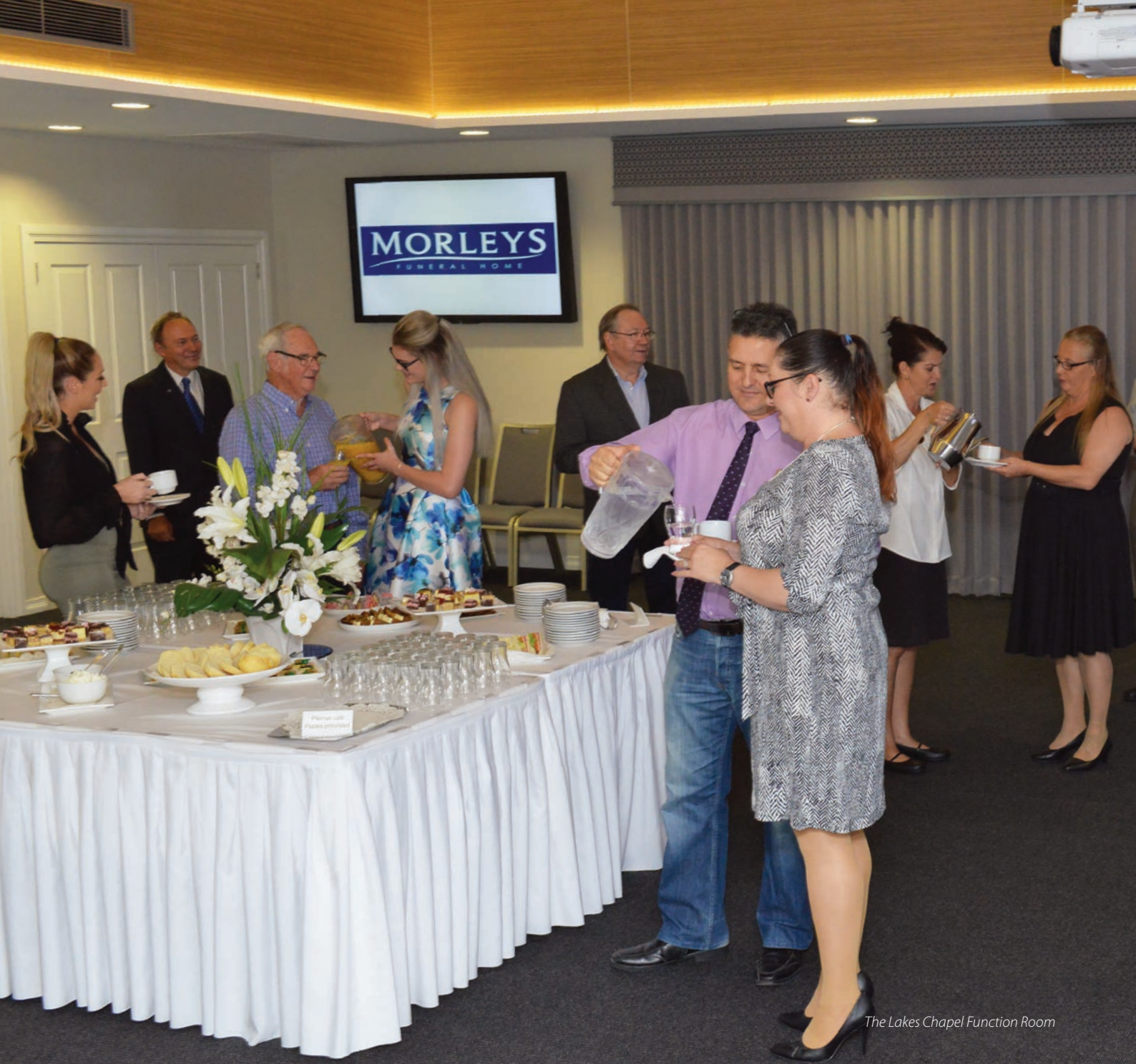
The Lakes Chapel Function Room