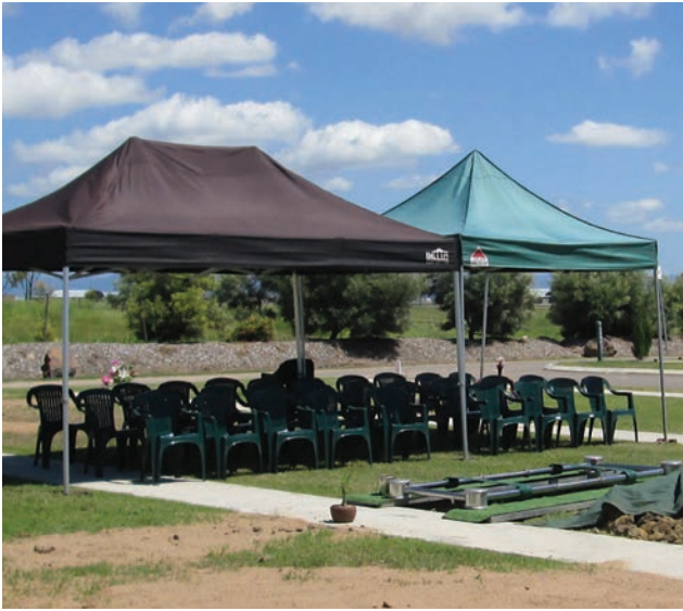
Belgian Gardens Lawn Cemetery