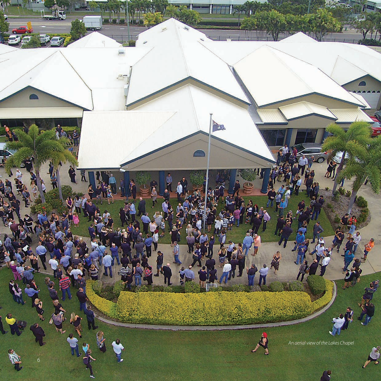
An aerial view of the Lakes Chapel