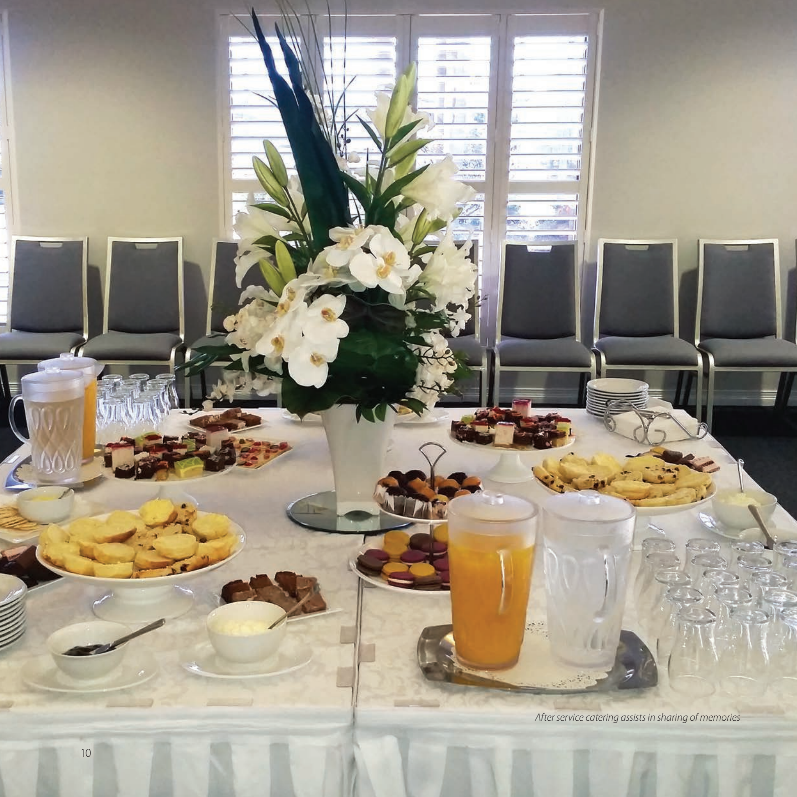
After service catering assists in sharing of memories