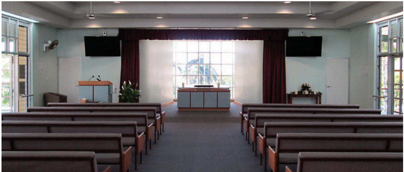
Woongarra Crematorium Chapel