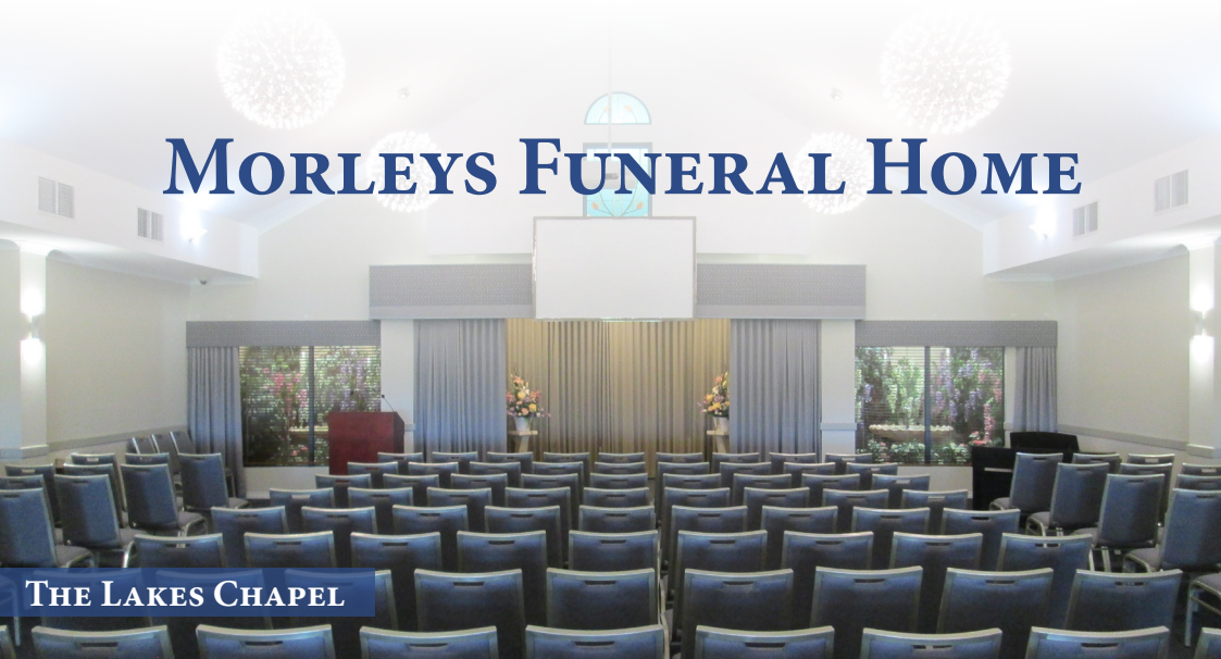
THE LAKES CHAPEL