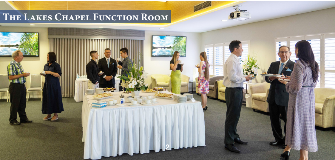
THE LAKES CHAPEL FUNCTION ROOM